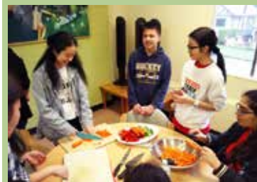
Good Food Organization