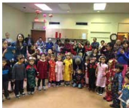
Diwali and Lunar New Year