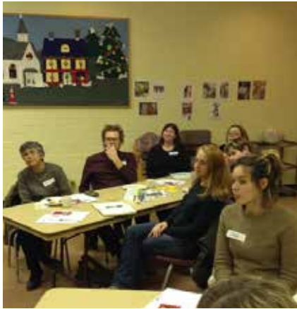
Living In Community Training with residents and service providers

Cedar Cottage Neighbourhood House is a welcoming place for people to come together, meet friends, feel supported and share their talents. The Highlights for the 2015-2016 year are: